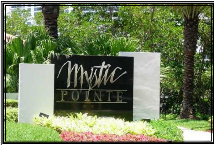
Mystic Pointe 100-200