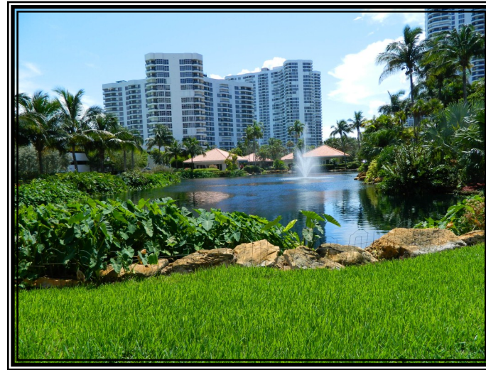
Scenic Mystic Pointe